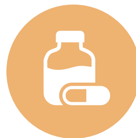
Chemical & Pharma