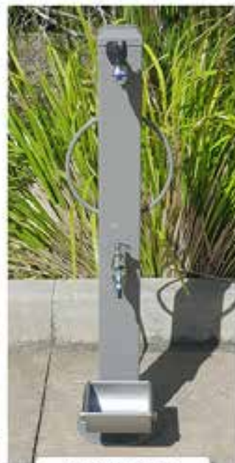
STANDARD plus leash handles