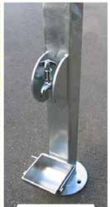
OPTIONAL tap shrouds