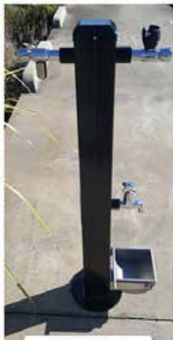
STANDARD plus optional Bottle Filler