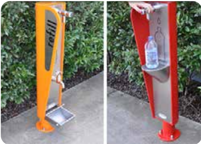
Tap and Dog Bowl