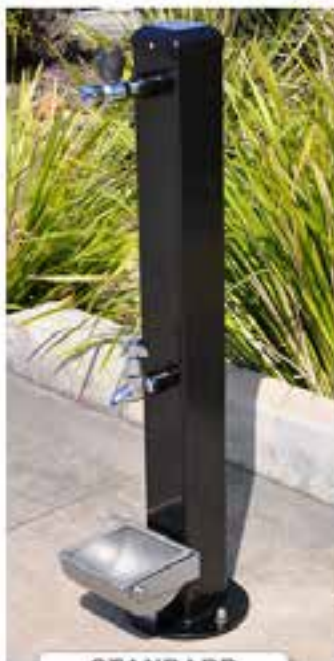
STANDARD includes bubbler & tap and dog bowl