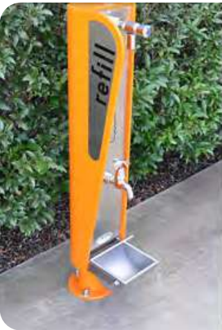
Tap and Dog Bowl